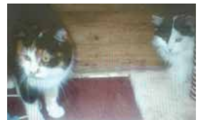
PEBBLES & MILLIE Stourbridge And District Rspca (October 2009)