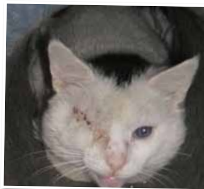
Malacky 'before' and 'after'. He is living proof of what a loving home and a little TLC can do!