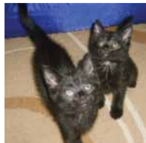
PANTHER & BLOSSOM Cat Homing & Rescue (CHAR), Warrington