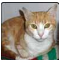
Comet - Ferne Animal Sanctuary, Somerset: With the best head butts for miles around!