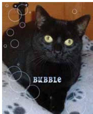
Bubble - TAG Pet Rescue, Kent: A friendly, loveable feline!