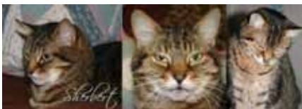
Sherbet - TAG Pet Rescue, Kent: Seeking a des.res. with a garden...