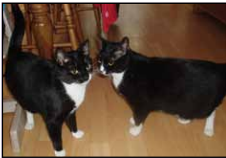
TUPPENCE & MOLEY - London South East RSPCA