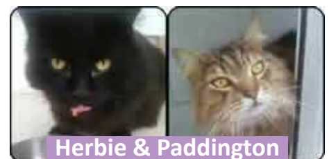
Herbie & Paddington