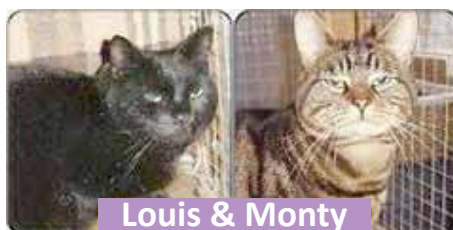
Louis & Monty