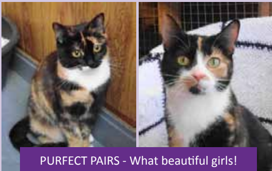
PURRFECT PAIRS - What beautiful girls!

We're glad to bring you news of some of the Cats that have found happiness together through the Cat Chat pages recently. To kick off our 'Purrfect Pairs' news for this issue, we have one of those emails that just makes you feel all warm and smiley: