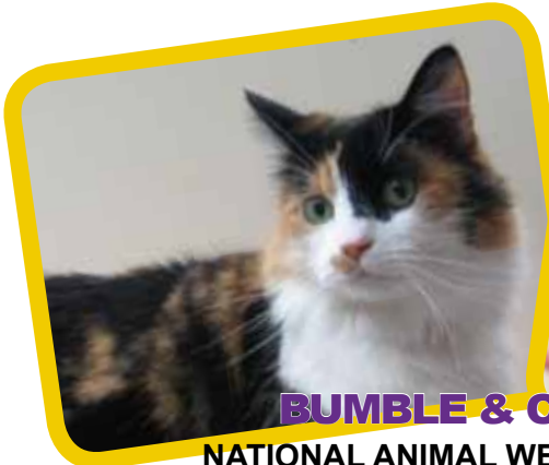
BUMBLE & COOKIE NATIONAL ANIMAL WELFARE TRUST THURROCK BRANCH, ESSEX