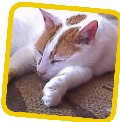
SPOTTY & TIDDLER FELINE NETWORK, DEVON