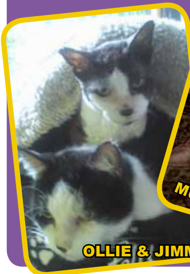
OLLIE & JIMMY

BURTON JOYCE CAT WELFARE, NOTTINGHAMSHIRE