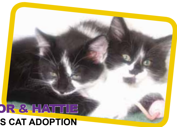
HECTOR & HATTIE WILLOWS CAT ADOPTION CENTRE, SOUTH SHIELDS