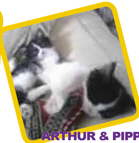
ARTHUR & PIPPA CAT ACTION TRUST 1977 DONCASTER