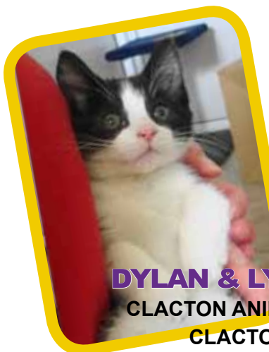
DYLAN & LYNDON CLACTON ANIMAL AID CLACTON