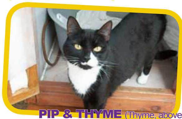
PIP & THYME (Thyme, above) NATIONAL ANIMAL WELFARE TRUST, THURROCK BRANCH