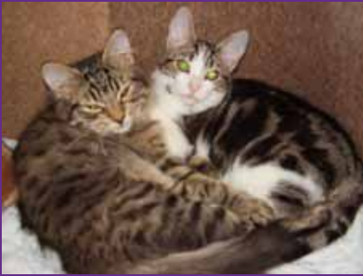
BILL & BEN