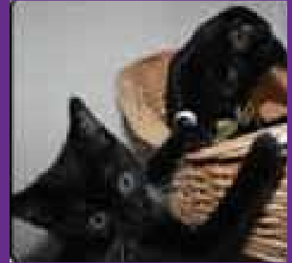
BORIS & DORIS

National Animal Welfare Trust, Thurrock Branch, Essex