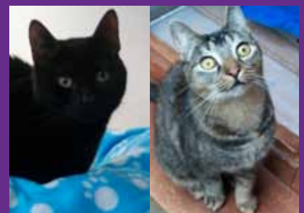
SIMBA & MANDY

National Animal Welfare Trust, Thurrock, Essex