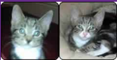
ALFIE & CHESTER