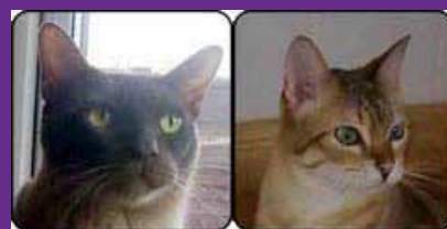
COCO & CAILAH

Friends Of Ferals Cat Group, Swanley, Kent