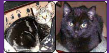
LEIA & MOLLIE