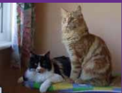
OSSIE & NINA

National Animal Welfare Trust, Thurrock, Essex