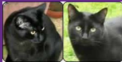
MONTY & PYTHON