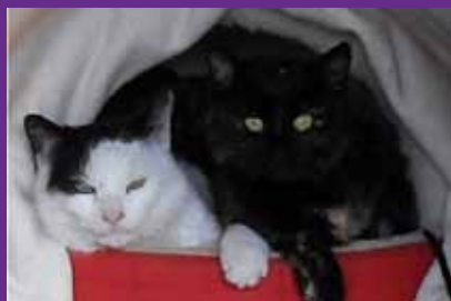
OLIVER & KIZZIE