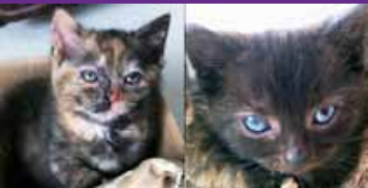
FANNY & MARGE

Bromley And District Cat Rescue, Bromley, Kent