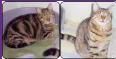
FREDDIE & TOBY

Bromley And District Cat Rescue, Bromley, Kent