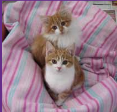
WILLIAM & KATE

Ann And Bill's Cat And Kitten Rescue, Hornchurch, Essex