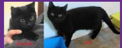
BONNIE & JET

Ashfield And Amber Valley Cats Protection, Derby, Notts