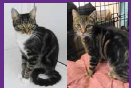
ARCHIE & TINKERBELLE