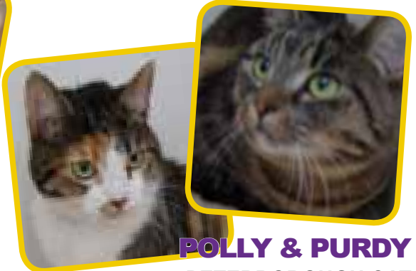
POLLY & PURDY