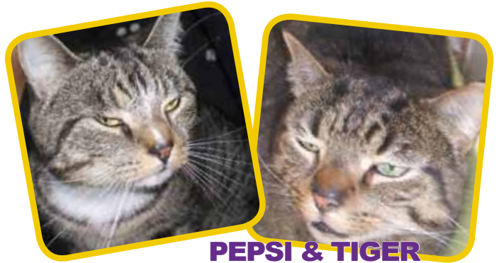
PEPSI & TIGER

SECOND CHANCE CAT RESCUE KEELBY NEAR GRIMSBY