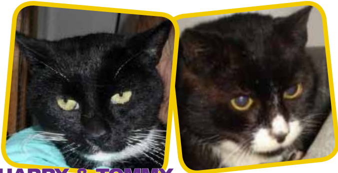
HARRY & TOMMY

SECOND CHANCE CAT RESCUE KEELBY NEAR GRIMSBY