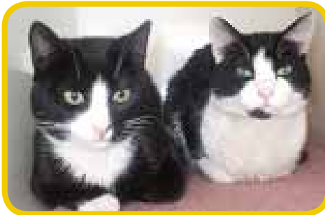
ALFIE & CHARLIE