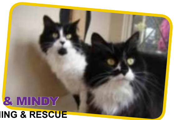
CINDY & MINDY

ANN & BILL'S CAT AND KITTEN RESCUE, ESSEX