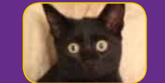
Bam Bam & Millie

Little Cottage Rescue Luton, Bedfordshire