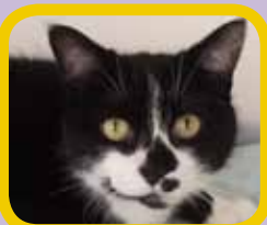
Pinky RSPCA Ashford, Tenterden & District, Kent

After several months of being in rescue, Beau now has a wonderful new home to call her own!