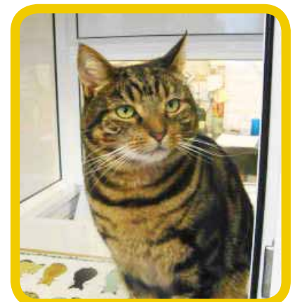
Bob - finally home again!

“It was obviously meant to be, because although his owner and her friend keep an eye on our Cat Chat page, they hadn’t looked for a few months. The friend spotted Bob just a couple of days after we had put him on Cat Chat! If it hadn’t been for his tail surgery and recuperation time, he would have been put on Cat Chat weeks ago and may well have been rehomed before they saw him. We had already had him microchipped and vaccinated for homing, so if he does go walkabout again, he should be reunited more quickly.” Clacton Animal Aid, Essex