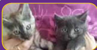
Pumpkin & Pie

Canino Animal Rescue Duston, Northampton