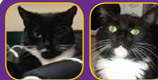
Astra & Bridie

Kats Cradle Cat Rescue Coven, Near Wolverhampton