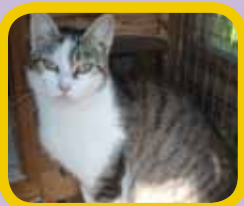
Cleo Burton-Upon-Stather Cat Rescue, Lincolnshire

Congratulations to this lovely lady on being adopted after a whole year in rescue.