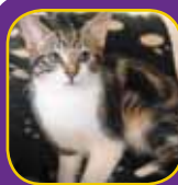
Chloe & Lily Clacton Animal Aid Essex