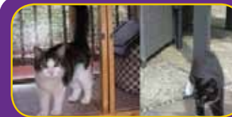
Twinkle & Alfie Little Cottage Rescue Luton