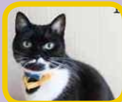
Fifi Animal Accident Rescue Unit, Nottinghamshire

Lovely Lola has found her 'happily ever after' at last, after over a year in rescue.