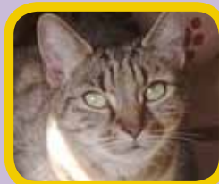
Beau Burton-Upon-Stather Cat Rescue, Lincolnshire

This lovely lady finally has a forever home after over a year in rescue.