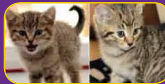
Pepper & Nutmeg

National Animal Welfare Trust, Thurrock Branch