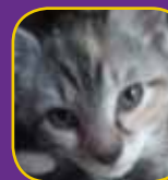
Ruby & Sapphire Prevent Unwanted Pets Fylde Coast, Lancashire