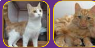
Meow & Tiggs

National Animal Welfare Trust, Thurrock Branch