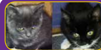
Two Kittens Burton Joyce Cat Welfare Nottinghamshire