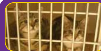
Sydney & Rosebud Willows Cat Adoption Centre South Shields