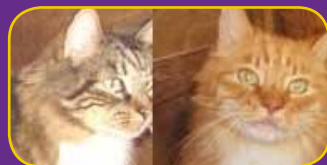
Minnie & Ned