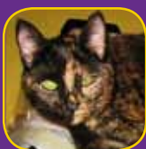
Biscuit & Cookie

Canino Animal Rescue Duston, Northampton