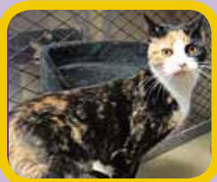
Annie National Animal Welfare Trust, Thurrock Branch, Essex

Despite being a long-term rescue cat, Shuna and her rescuers never gave up hope of her finding a forever home, which she is now thrilled to have.