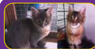
Moonlight & Tiger Burton Joyce Cat Welfare Nottinghamshire