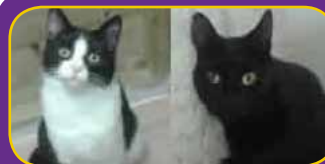
Quito & Tawny

Cats Protection, Beverley and Pocklington branch