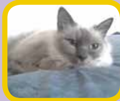
Shuna Cat Homing & Rescue (Char), Warrington

Having been overlooked for a year and a half, Olivia was at last snapped up after just a few weeks of appearing on Cat Chat!