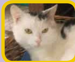
Dudley Kirkby Cats Home, Nottingham

After being in rescue for almost 18 months, this lady finally has a forever home to call her own.