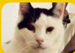
Robbie Feline Network, Devon

At 15-years-old, this lovely chap now has the forever home he has dreamed of.