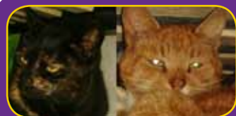
Cinders & Toffee Canino Animal Rescue Nottinghamshire