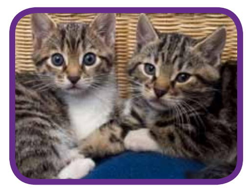
Thanks to Coppercat Photography for these top tips & fab photos