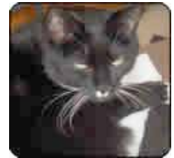
ARCHIE BEWDLEY CAT ACTION TRUST 1977, WORCESTERSHIRE