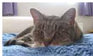
OSCAR We are especially pleased for Oscar who was thirteen years old, and was seen on the Catchat site... Thanks to you all. CATS IN NEED, Nuneaton & Hinckley (April 2010)