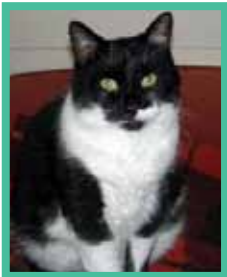
Bessie from Kingsdown Cat Sanctuary, Kent – A Very Important Pussycat (VIP)

These potential house mates won't be able to pay rent, chip in with the house work or get the groceries in... But then they won't squeeze the tooth paste tube from the middle, or leave the toilet seat up either!! What they will do, is be truly grateful for the chance of a home, and fill your life with love and purrs: