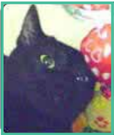
Sylvester from Animal Aid, Walton, Merseyside – A cheeky monkey!

If you'd like to consider sharing your home with one of these deserving cats, log on to www.catchat.org and visit our Top Cats section for details. If these cats get their lucky break, we will be delighted to give you the news in the next newsletter!