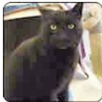
CHIP RSPCA, CRAVEN AND UPPER WHARFEDALE