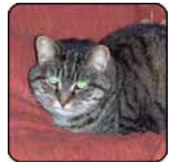
MACAVITY Hi, Macavity was saved having to come into the rescue, featured on our homing page she attracted attention and was homed straight from her owner. Thank you to the person that was prepared to give a nervous, older cat a chance. BURTON JOYCE CAT WELFARE, Notts. (March 2010)