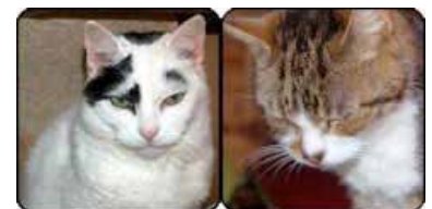
BOY GEORGE AND MR JONES Boy George and Mr Jones have been rehomed to a wonderful young couple who wanted to give two elderly cats a second chance. CAT ACTION TRUST - Carmarthenshire Branch (March 2010)

To see some super Golden Oldies, waiting right now in a rescue centre near you, visit: www.catchat.org/topcats/topcats.html