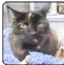
PURDY The good news is that Purdy has been spotted by a couple looking for an older cat and she has now left us. KIRKBY CATS HOME, Kirkby in Ashfield, Notts (March 2010)

OLDER CATS – HOMED So many people automatically choose a kitten when adopting a cat, but kittens don't stay kittens for long! Mature Mogs are so grateful to have found a loving home again - they will repay your love ten-fold! So hats off to the following Senior Kittizens and their adoptors. We wish you long and happy lives together!