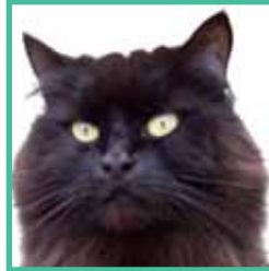
China from Colchester Cat Rescue, Essex – Seeks Companionship.