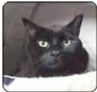
SERENA PAWS INN, CHESHIRE