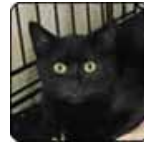
JET CLACTON ANIMAL AID, CLACTON