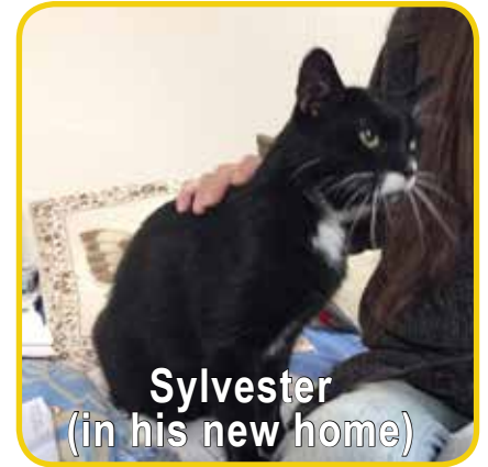
Sylvester (in his new home)