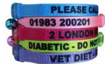
personalised soft cat collars from www.kittycollars.co.uk