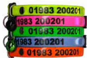
personalised reflective cat collars from www.kittycollars.co.uk

Visit us here: www.kittycollars.co.uk Sponsors of Cat Chat's Shelter Listings