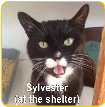
Sylvester (at the shelter)