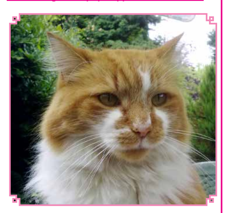
Rest in Peace Ziggy xx

catchat.org/index.php/support/remembrance